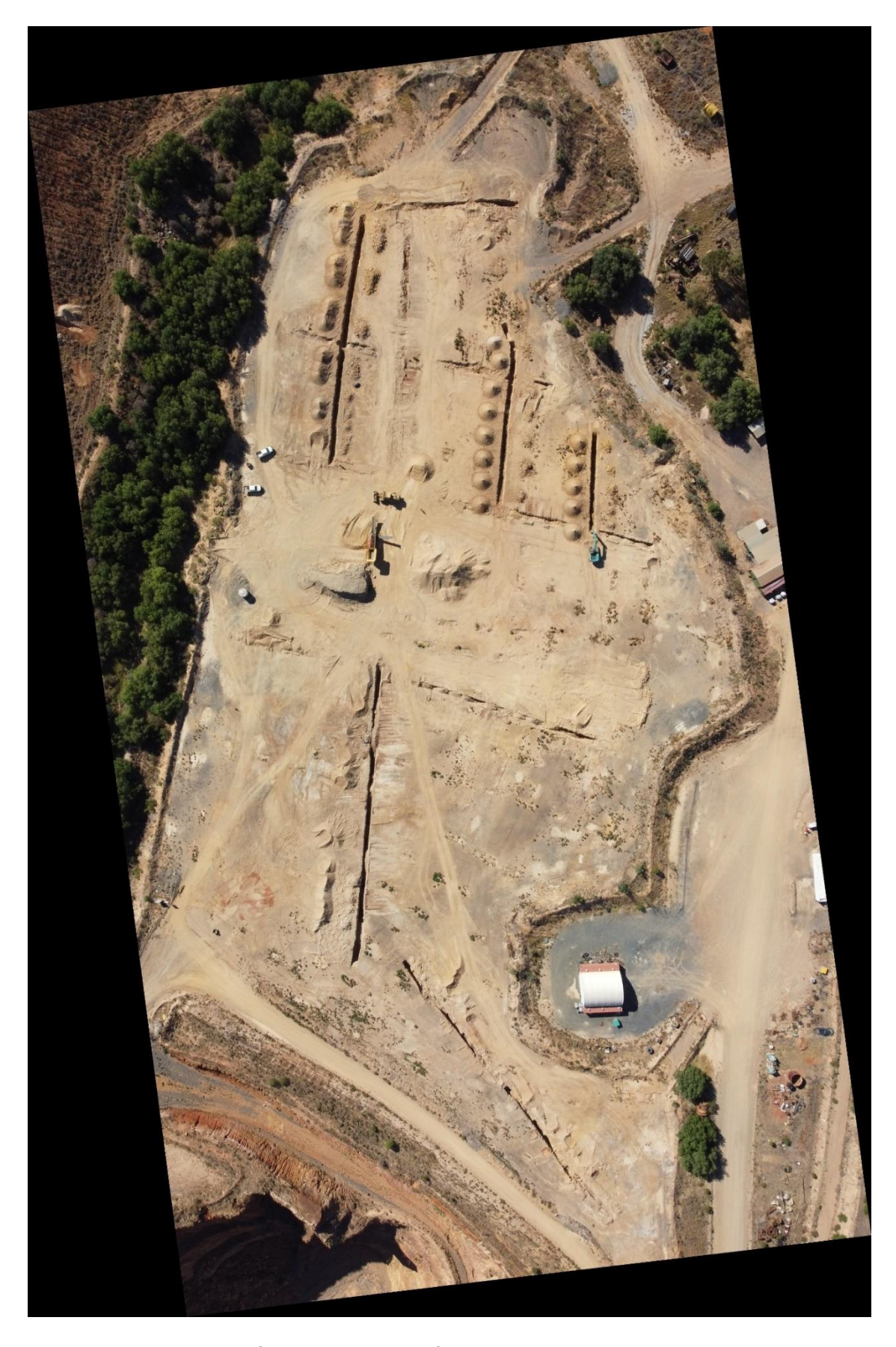
Figure 1: Drone view of Trench evaluation of the Mt Boppy ROM rock dump and tailings