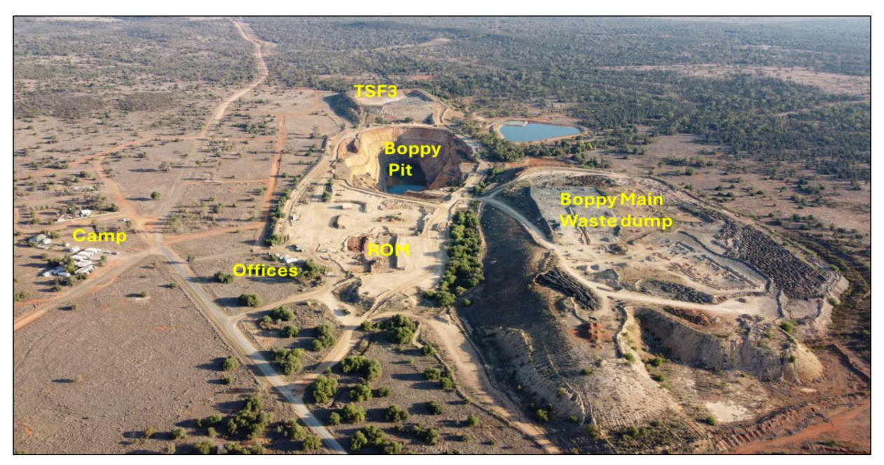
Figure 1: Drone image looking south showing the main components of the Rock Dump and Tailings Resources in relation to the Mt Boppy open pit.

A 26-borehole sonic drilling evaluation was completed on the Boppy Main Waste dump and the TSF3 impoundment including Potential Acid Forming (PAF) material overlying part of the tailings (Figure 1). The sonic evaluation drilling has enabled sampling of the full profile of the rock and tailings dumps, and thus assessment of the economic viability of treating crushed and screened rock dump fines and tailings on site at Mt Boppy.