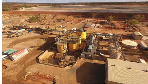
Mt Boppy Gold mine (left) & Wonawinta Silver Mine (right)